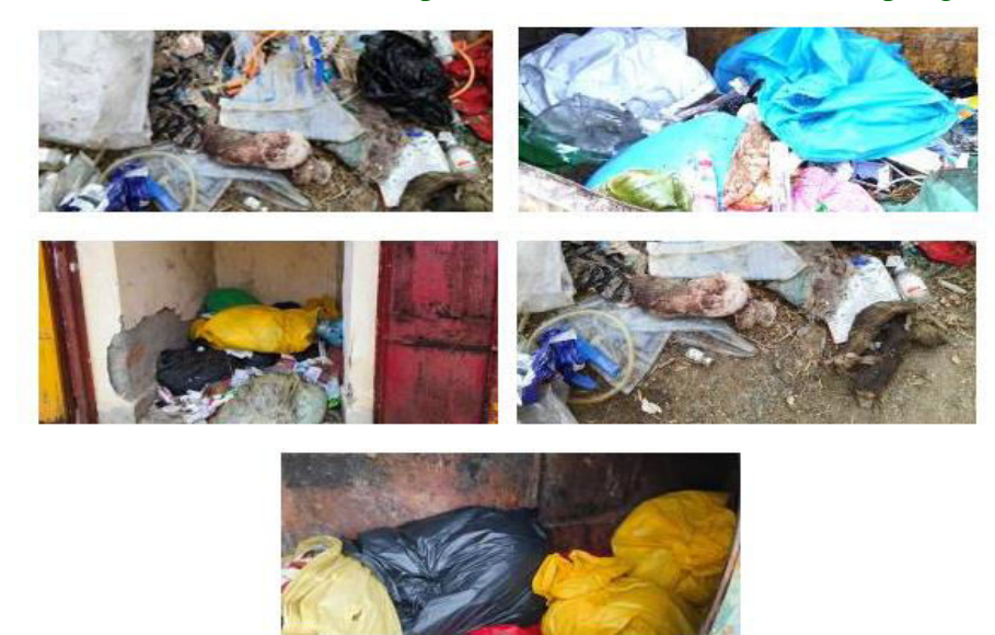
Figure.1 Biomedical Wastes samples collected from different sampling sites.